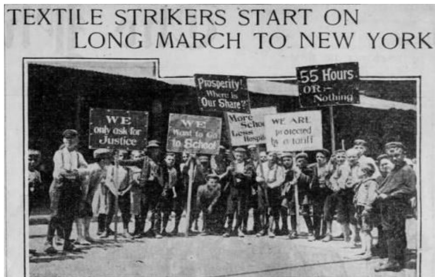
March of the Mill Children