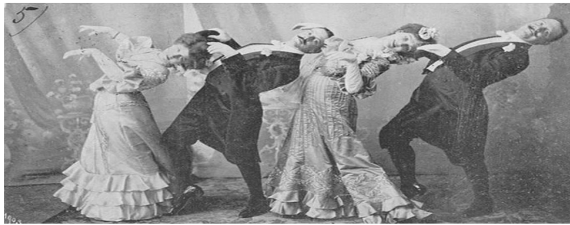
Example of Cake Walking