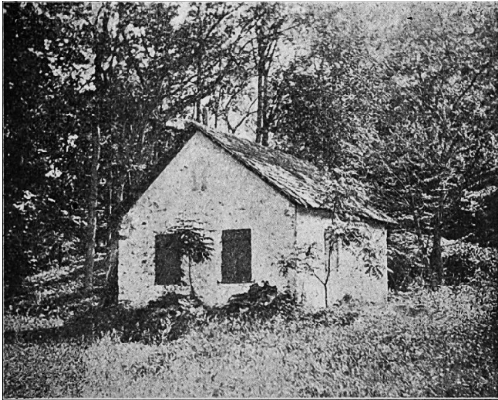
THE RED LION SCHOOL HOUSE, ON THE POQUESSING

If one desired lighter fare, the old, refurbished Red Lion School sold cold milk, sandwiches, and pies. The school stood on the edge of the Poquessing Creek, presently the location of The Taggart House, 9961 Frankford Avenue. Women who had taught at the Red Lion School told of times when the rains made the waters of the Poquessing rise so high that they had to evacuate the students from the flooded school.